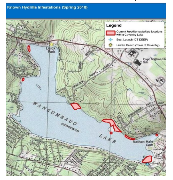
Known locations of hydrilla at Coventry Lake (Wangumbaug Lake). Boaters should avoid these areas noted with red to avoid fragmenting and spreading hydrilla.

COVENTRY LAKE (invasive species alert) . Hydrilla, a very highly invasive aquatic plant, has been found growing in Coventry Lake. All lake users should take extra care to check and clean their boats (including canoes, kayaks and rowing sculls), trailers, and fishing equipment before leaving the launch.