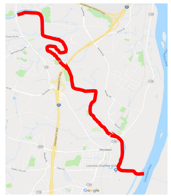
Section of the lower Farmington River possibly affected by the recent firefighting foam release under the cautionary advisory.

<u>www.ct.gov/deep/invasivespecies</u> or the Aquatic Invasive species section of the 2018 CT angler's Guide(<u>www.ct.gov/deep/anglersguide</u>).