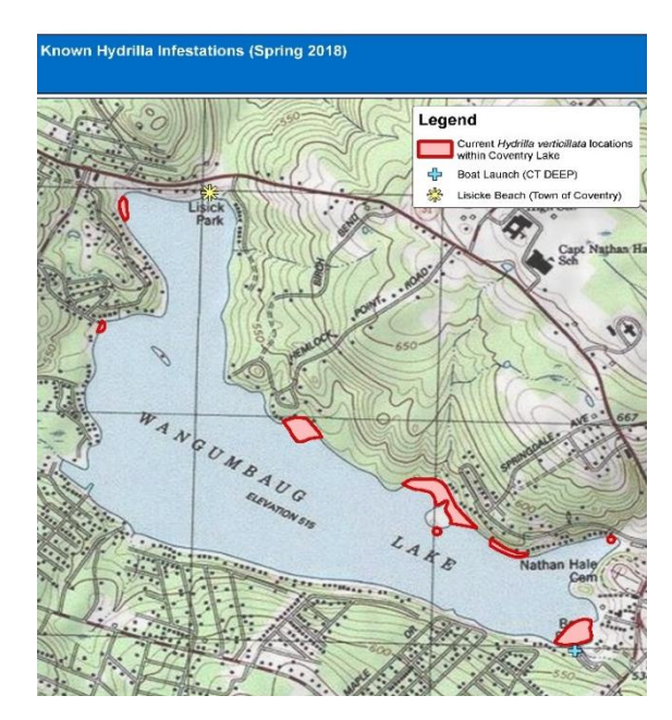
Known locations of hydrilla at Coventry Lake (Wangumbaug Lake). Boaters should avoid these areas noted with red to avoid fragmenting and spreading hydrilla.

COVENTRY LAKE (invasive species alert). Hydrilla, a very highly invasive aquatic plant, has been found growing in Coventry Lake. All lake users should take extra care to check and clean their boats (including canoes, kayaks and rowing