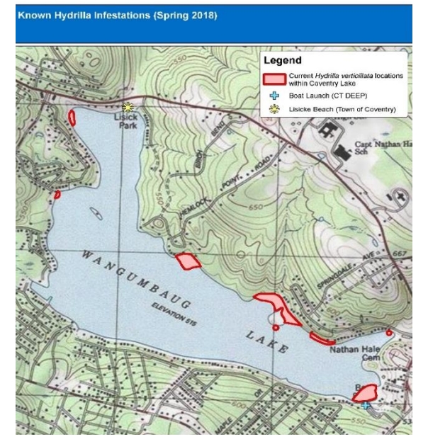
Known locations of hydrilla at Coventry Lake (Wangumbaug Lake). Boaters should avoid these areas noted with red to avoid fragmenting and spreading hydrilla.

HOUSATONIC LAKE (rowing regatta). A school rowing event is scheduled for Saturday, May 11 from 2:00 pm to 6:00 pm. Boaters should use additional caution on the lake Saturday.