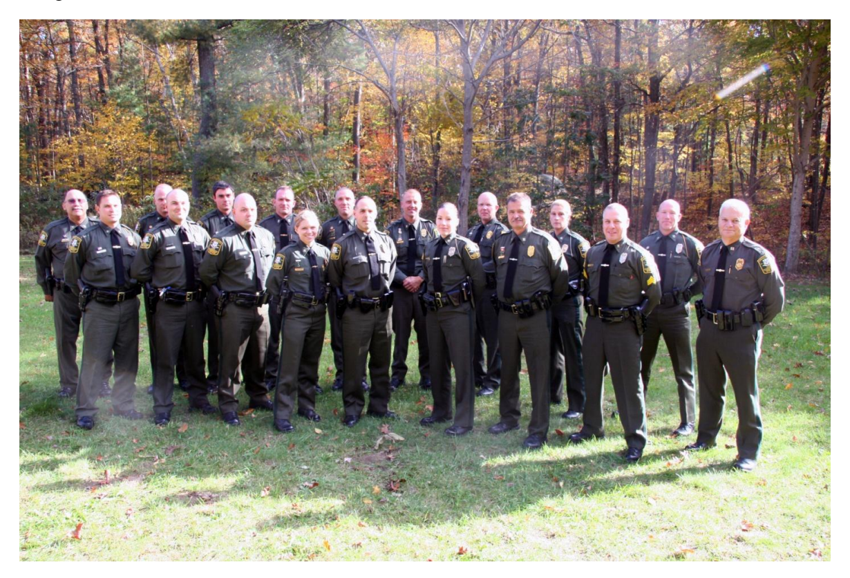
EnCon Police Western District

In 2012, the Western District handled 3,155 incidents, made 750 arrests, and issued 417 warnings.