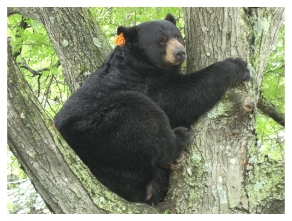
Black bear that was tranquilized and relocated out of Simsbury.

EnCon Police Officers work with the Department's wildlife biologists to monitor Connecticut's growing black bear and moose populations. Officers also help to educate the public about living with black bears. In 2012, there were 125 nuisance bear complaints. During the winter months, hibernating bears are located and data regarding health, population and the number of cubs with sows is gathered for statistical analysis. In the unusual event that a moose moves into a highly populated area, EnCon Police Officers will assist in its relocation to a more suitable rural environment. Moose require special handling when tranquilized, and must be monitored until the animal can safely return to the wild.