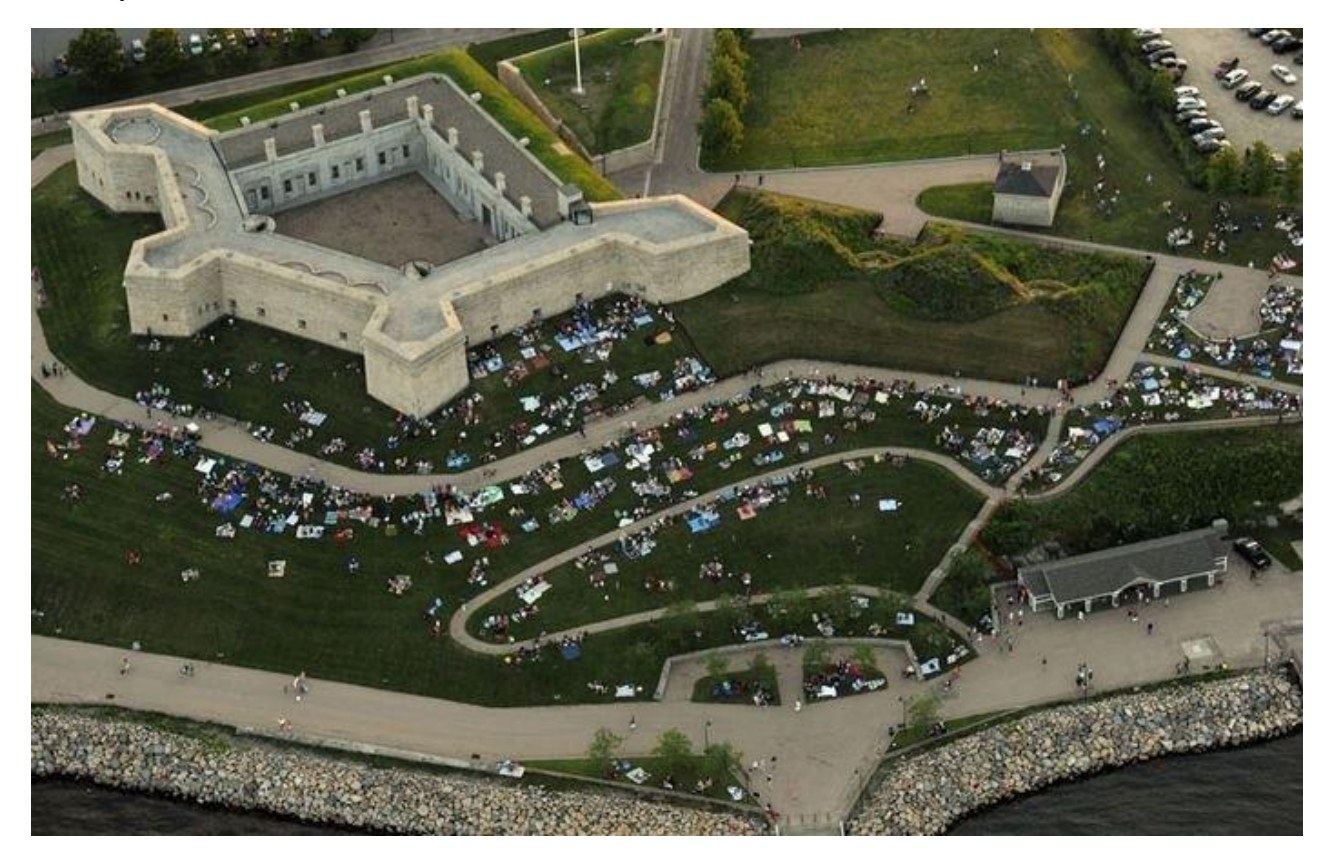
Fort Trumbull State Park in New London prior to OpSail 2012.

EnCon Police Officers serve as the primary police agency within our state parks and forests. Criminal activities that occur in cities and towns throughout the state also occur in our parks and forests. Officers routinely patrol the state parks and forest areas to deter criminal activity. When crimes do occur officers conduct investigations with the primary goal of public safety and apprehending those responsible for the criminal activity. During 2012, officers responded to 3,215 incidents, made 905 arrests, and issued 498 written warnings in our state parks and forest for crimes against people and property, as well as narcotics and alcohol violations. The EnCon Police Division utilizes 29 Special Conservation Officers to assist in patrolling these areas during the busy outdoor recreation season.