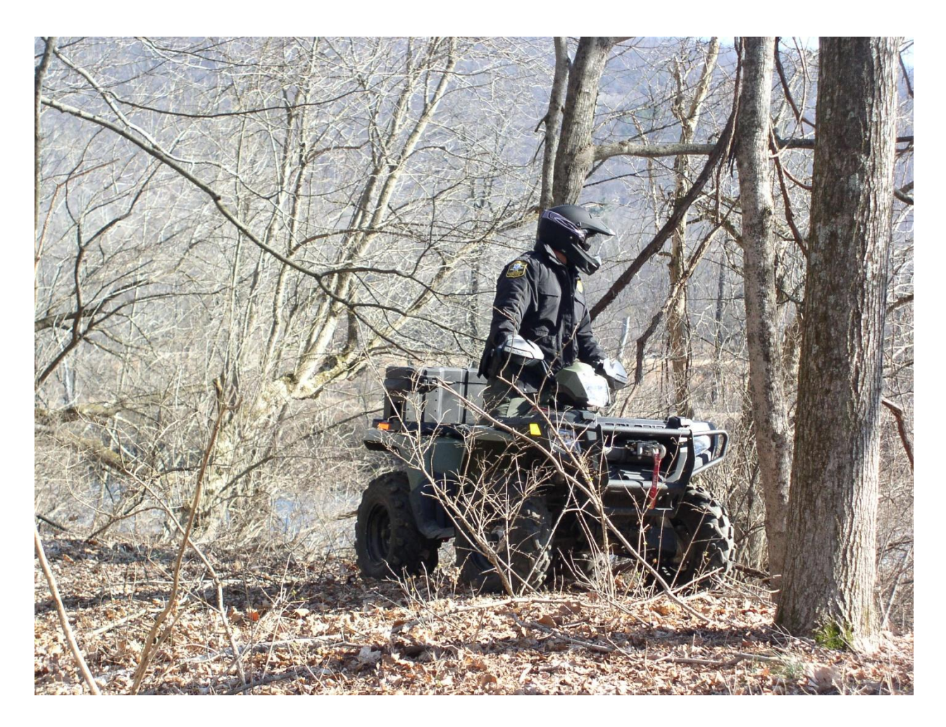
EnCon Police Officer on ATV Patrol

EnCon Police Officers enforce state laws and regulations pertaining to the operation of snowmobiles and all-terrain vehicles on state owned or managed properties and on frozen bodies of water. Officers utilize snowmobiles and all-terrain vehicles to patrol for potential violations. In 2012, EnCon Police Officers responded to 292 incidents related to recreational vehicles and made 93 arrests and issued 25 written warnings for violations.