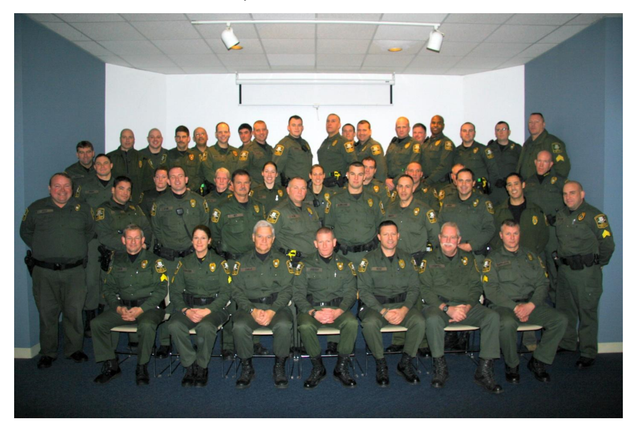
State Environmental Conservation Police Officers