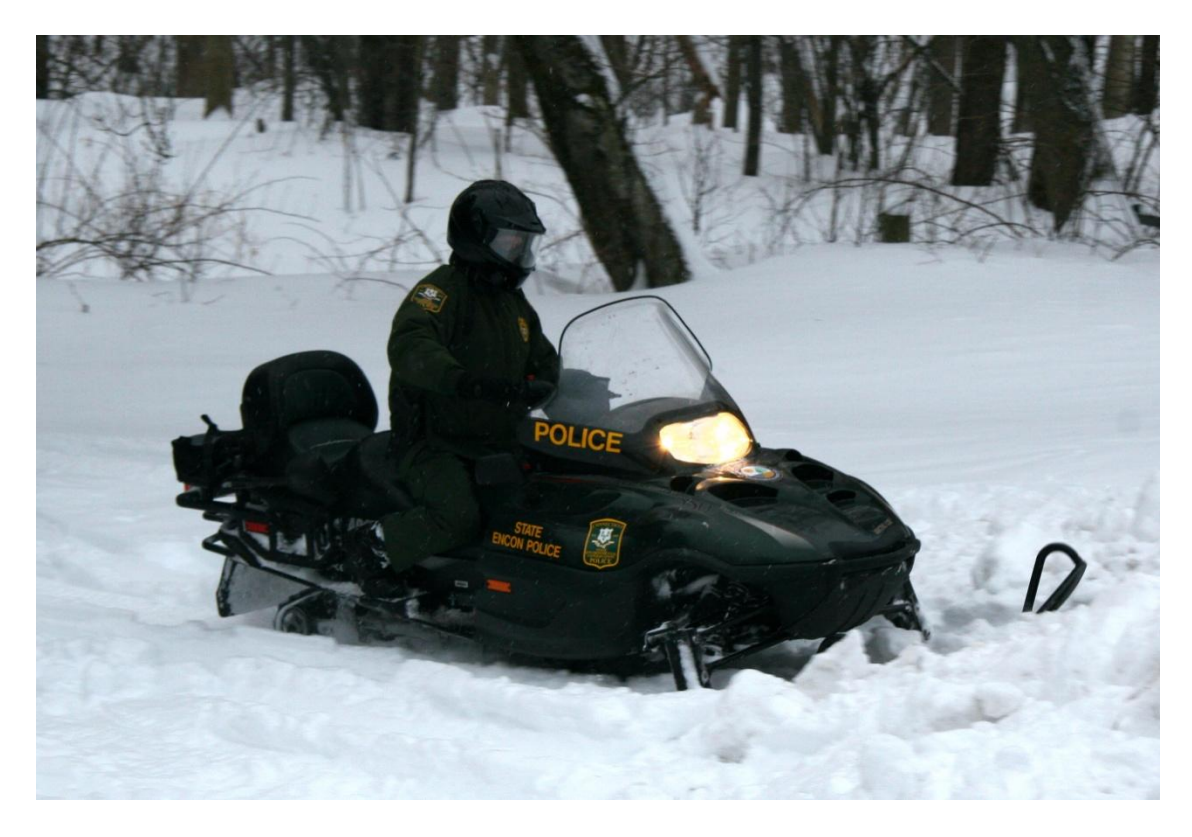
Search & Rescue Operation Western District Officer

EnCon Police Officers provide a valuable service to local and State Police departments, fire departments and the United States Coast Guard in search and rescue operations. Officers have extensive knowledge of remote areas of the state and our water-bodies including Long Island Sound, which are an invaluable asset to search and rescue operations. Officers conducting searches use all-terrain vehicles, snowmobiles, mountain bikes, four wheel drive vehicles and specially equipped patrol vessels. In 2010, EnCon Police Officers responded to 71 search and rescue (SAR) and missing person incidents in Connecticut state parks and forests, lakes, rivers, Long Island, and Fishers Island Sound. The Division's officers are also called upon during weather-related emergencies such as floods and snow storms to coordinate evacuations and assist stranded motorists on state roads.