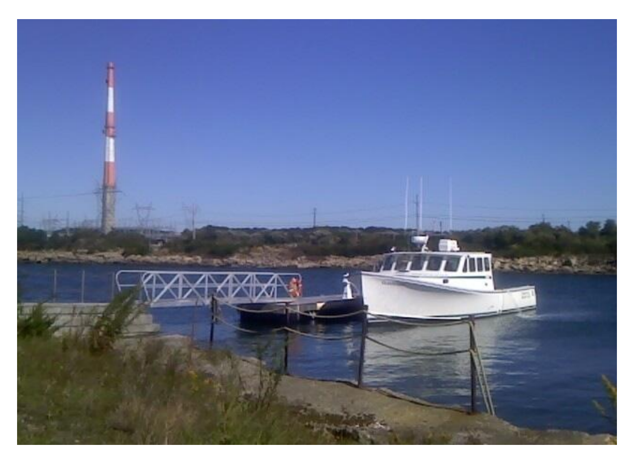
Patrol Vessel Guardian at Millstone boat basin dock

The EnCon Police division has been increasingly involved in Homeland Security responsibilities since the terrorist attacks on September 11, 2001. The Division continually participates in special drills and training in regards to Homeland Security issues. Officers often assist both federal and state law enforcement agencies in the event of a dignitary visit, or to provide security and patrols of critical assets within the state. EnCon Police officers actively patrol public watershed areas to enhance the level of security of public drinking water supplies, and conduct waterborne security patrols of the major harbors and ports. These patrols augment U.S. Coast Guard resources to protect vital infrastructure security. The EnCon police Division maintains a mobile command post and dock at Millstone Nuclear Power Plant in Waterford. Officers patrol this area throughout the year and on a twenty-four hour/seven-day a week basis during times of elevated terrorist threat levels.