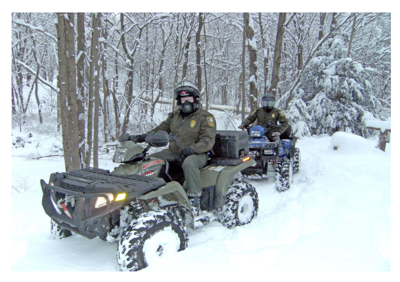
ATV Enforcement Western District Officers

EnCon Police Officers enforce state laws and regulations pertaining to the operation of snowmobiles and all-terrain vehicles on state owned or managed properties and on frozen bodies of water. Officers utilize snowmobiles and all-terrain vehicles to patrol for potential violations. In 2010, EnCon Police Officers responded to 363 incidents related to recreational vehicles and made 140 arrests and issued 22 written warnings for violations.