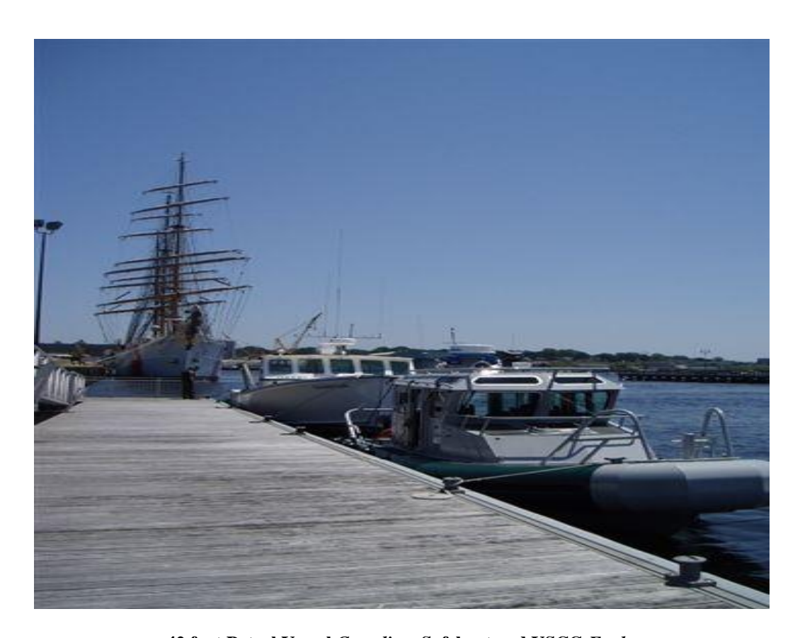
42 foot Patrol Vessel Guardian, Safeboat and USCG Eagle

EnCon Police Officers are responsible for recreational boating safety enforcement for all waters within the state, including Fishers Island and Long Island Sound. To enhance the safety of boaters, EnCon Police Officers inspect boats for safety equipment requirements, operator certificates, as well as monitor boating traffic for moving violations and boating under the influence violations. Officers also investigate boating accidents that occur on Connecticut waters. The Division maintains a Boating Accident Reconstruction Unit (B.A.R.U) whose members investigate boating accidents that involved death or serious physical injury of a person. The Unit consists of ten officers and one sergeant, who are all trained in the field of boat accident reconstruction. In 2010, the Division investigated 84 boating accidents.