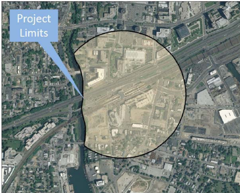
Figure 2 : Project Limits