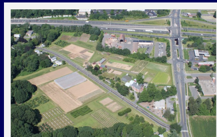
Valley Laboratory, Windsor

Valley Laboratory 153 Cook Hill Road Windsor, CT 06095-0248 Phone: 860-683-4977