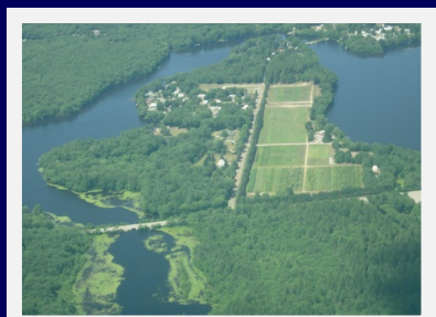
Griswold Research Center, Griswold

Griswold Research Center 190 Sheldon Road Griswold, CT 06351-3627