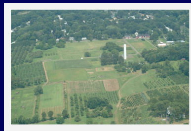
Lockwood Farm, Hamden

Lockwood Farm 890 Evergreen Avenue Hamden, CT 06518-2361 Phone: 203-974-8618