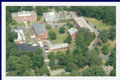
Main Laboratories, New Haven

Main Laboratories 123 Huntington Street New Haven, CT 06511-2016 Phone: 203-974-8500