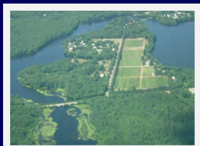
Griswold Research Center, Griswold

Griswold Research Center 190 Sheldon Road Griswold, CT 06351-3627