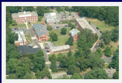
Main Laboratories, New Haven

Main Laboratories 123 Huntington Street New Haven, CT 06511-2016 Phone: 203-974-8500