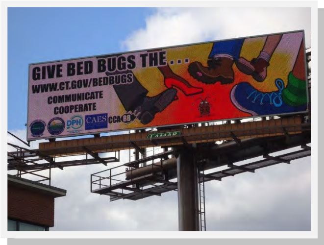
CCABB with a grant from DEEP launched a second electronic billboard bed bug informational display on I95 southbound in Bridgeport and I91 northbound in Hartford. It will run until February 16 th 2016.