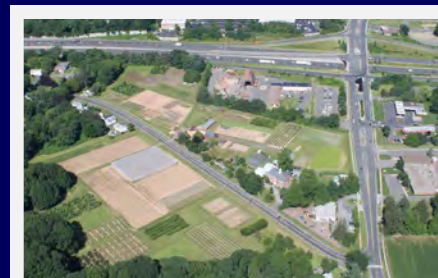
Valley Laboratory, Windsor

Valley Laboratory 153 Cook Hill Road Windsor, CT 06095-0248 Phone: 860-683-4977