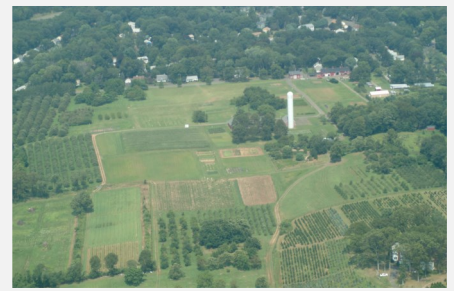
Lockwood Farm, Hamden