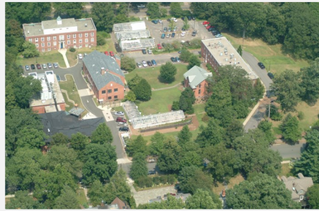
Main Laboratories, New Haven