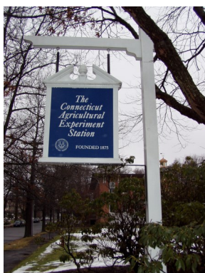
Entrance to The Connecticut Agricultural Experiment Station in New Haven on Huntington Street