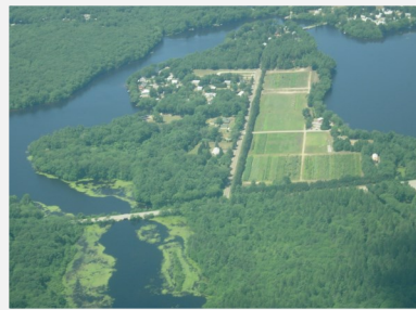
Griswold Research Center, Griswold