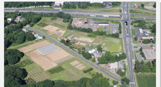
Valley Laboratory, Windsor