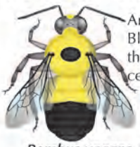
Bombus vagans half-black bumble bee

4. 2nd Ab entirely yellow and Ab 3-6 black