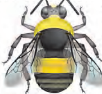
Bombus terricola yellowbanded bumble bee

Smaller and stouter than many other bumble bees. Fringe of yellow hairs near end of abdomen.