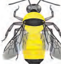
Bombus fervidus yellow bumble bee

Black on top and front of head. Sides of thorax yellow.