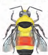
Bombus ternarius tricolored bumble bee

Rear 1/2 of thorax yellow. Common in northern MN.