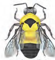
Bombus affinis rusty patched bumble bee

Center spot on thorax with sometimes faint V shaped extension back from the middle.