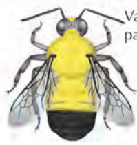
Bombus perplexus confusing bumble bee