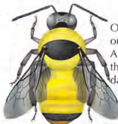
Bombus pensylvanicus American bumble bee

Black on top and front of head. Sides of thorax yellow.