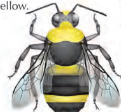
Bombus fernalde Fernalde cuckoo bumble bee

Ab seg 6-7 with orange. Variable color. Often with yellow on rear half of thorax. Sometimes Ab 2-3 yellow