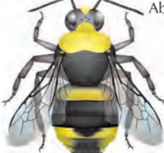
Bombus ashtoni Ashton's bumble bee