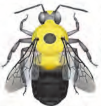
Bombus griseocollis brown-belted bumble bee

2nd Ab with yellow in middle, black on sides. Yellow often in a "W" shape. Eyes not large.