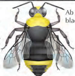
Bombus insularis indiscriminate cuckoo bumble bee

Smaller and stouter than many other bumble bees. Fringe of yellow hairs near end of abdomen.