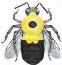
Bombus bimaculatus two-spotted bumble bee

1. Black on sides of 2nd Ab, yellow or rusty in center