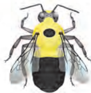
Bombus impatiens common eastern bumble bee

2nd Ab with yellow in middle bordered by rusty brown in a swooping shape. Large eyes.