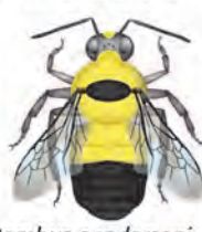
Bombus sandersoni Sanderson's bumble bee

Ant 3 is short. Short hairs on back of ant segments 3 and 4. Many black hairs on thorax. Smaller than vagans.