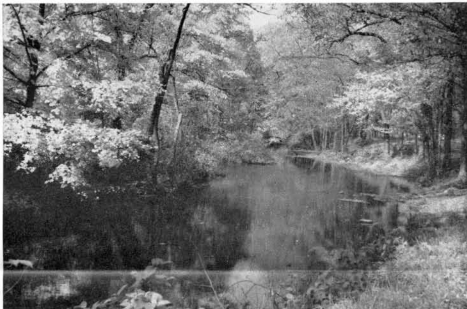
"All the myriad forms and colors . . . our heritage. . ."