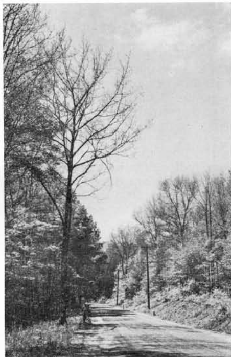
Feeding by larvae of the gypsy moth becomes of increasing public concern as more and more people live in or near woodland areas.

Fortunately, areas of complete defoliation are usually small and appear infrequently. Oak trees, unlike some