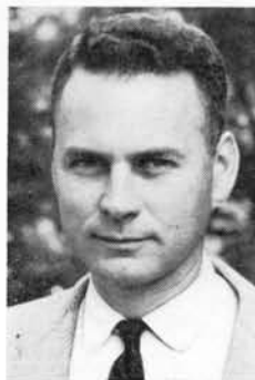
Dr. Waggoner heads research in soils and climatology. Station Bulletin 634, available in December, will give details of research on plastic mulching.

Paper reflects much solar radiation, while readily emitting long-wave radiation. Thus it retards the gains of heat by the soil more and retards the losses less.