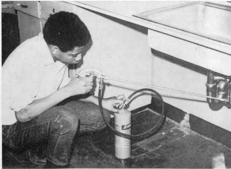
Figure 2. Applying pyrethrin aerosol with a 5-lb. bomb.