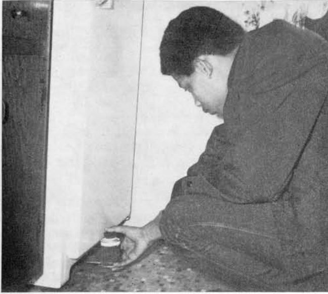
Figure 1. Applying dust or bait, using a hand duster.