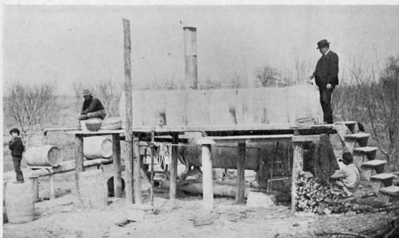
a. Improved stationary cooking plant of J. H. Hale, South Glastonbury. Capacity of this plant is about 50 barrels of mixture per day.