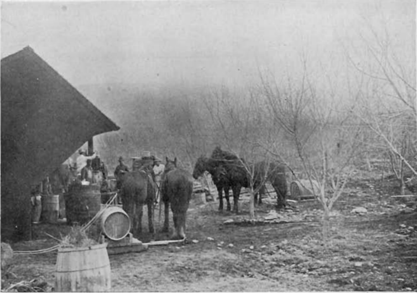
a. The noon hour in spraying time. Portable boiling plant and outfits for applying the lime and sulphur mixture.