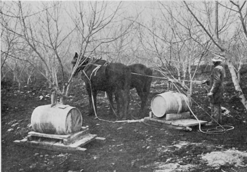
b. Nearer view showing methods of mounting pump and barrel. The proper method is shown at the right. This is an excellent outfit for a rough orchard.

VIEWS IN ORCHARD OF HIGHLAND FRUIT CO., WALLINGFORD.