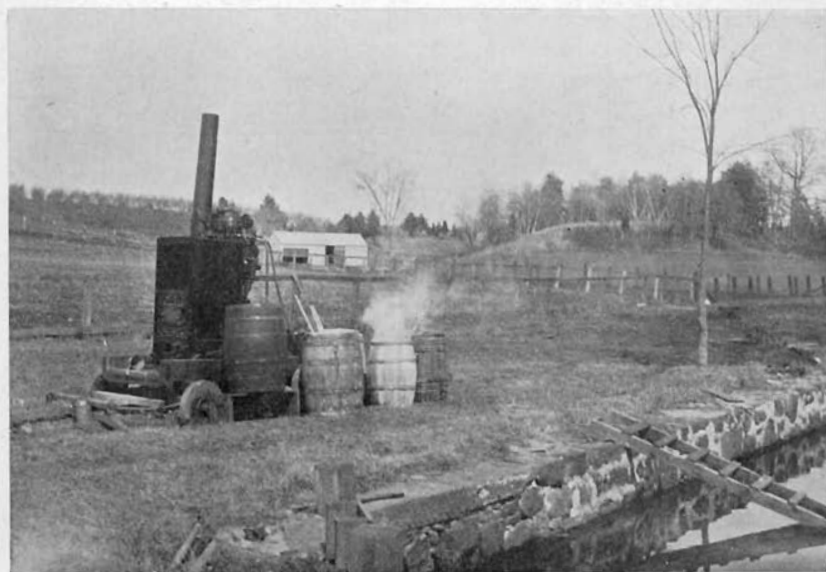
b. The common method in Connecticut orchards. A portable engine with boiler is placed near the orchard where water can be obtained. Steam is conveyed to the barrels through common rubber hose.

STATIONARY AND PORTABLE STEAM COOKING PLANTS.