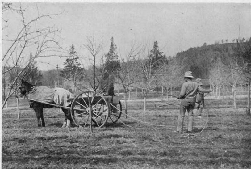
a. Applying the mixture to infested pear trees.