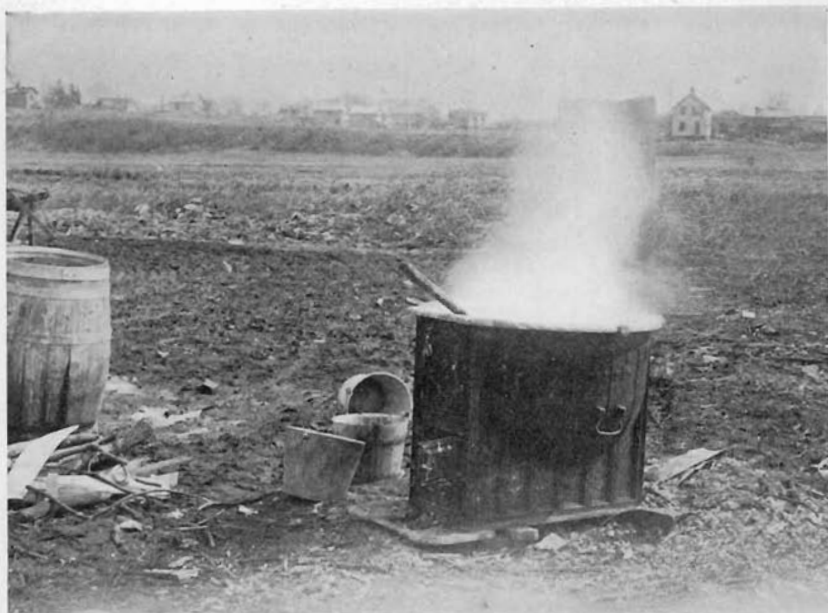
b. Boiling the lime and sulphur mixture in a kettle or feed cooker.