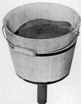
b. An excellent home-made strainer and funnel.