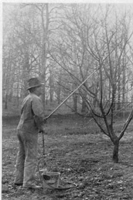
c. Spraying a tree with a bucket pump. This is an excellent outfit for the garden and the city yard.