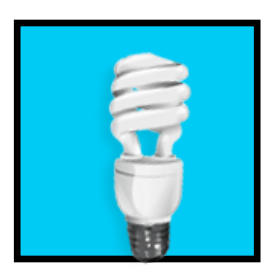
Using CFLs can reduce energy bills and help save the environment.

CFLs contain a small amount of mercury, about the size of a pen point. Mercury forms a vapor that you can inhale. If a bulb breaks, it needs to be cleaned up properly to protect everyone in the house.