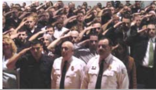
Members of Class #234 after taking the oath.

Governor Rell addressed the graduates and discussed the importance of their work in the agency. Governor Rell stated, "As you start down the path of courage, dedication and commitment to public service, Aim for Excellence." With that advice, the graduates were awarded their diplomas and badges.